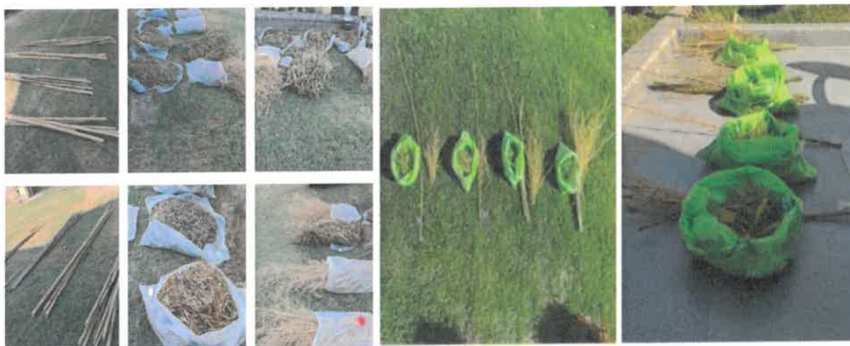
Figure 3. Preparation of destructive plant samples on biomass components for the determination of dry biomass

In the case of the madake bamboo ( Phyllostachys bambusoides ) plantation, due to the low planting density practiced at the establishment of the plantation (200 plants/ha), 10 plants were randomly selected along the diagonal of the plantation. Biometric determinations were carried out on these plants regarding the number of stems per plant, the height and diameter of the stems, as well as the biomass and the amount of carbon accumulated in the above-ground parts of the plants, along with the degree of reduction of greenhouse gas emissions. The recorded results were reported per plant and subsequently per unit area in direct correlation with the plant density established at the establishment of the plantation.