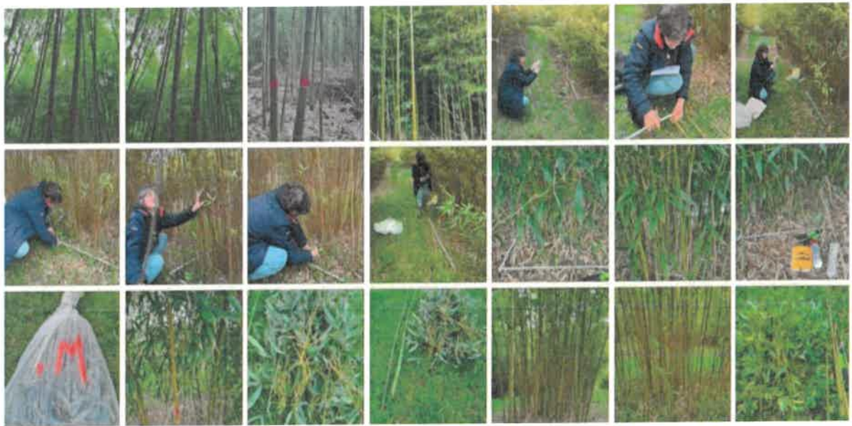
Figure 2. Collection and labeling of destructive plant samples on biomass components bamboo plantations

After determining the fresh biomass, the analysis samples were transferred for the purpose of drying. The drying of the analysis samples was carried out at a temperature of 95°C for 48 hours for stems and branches, and at a temperature of 60°C for 24 hours for leaves.