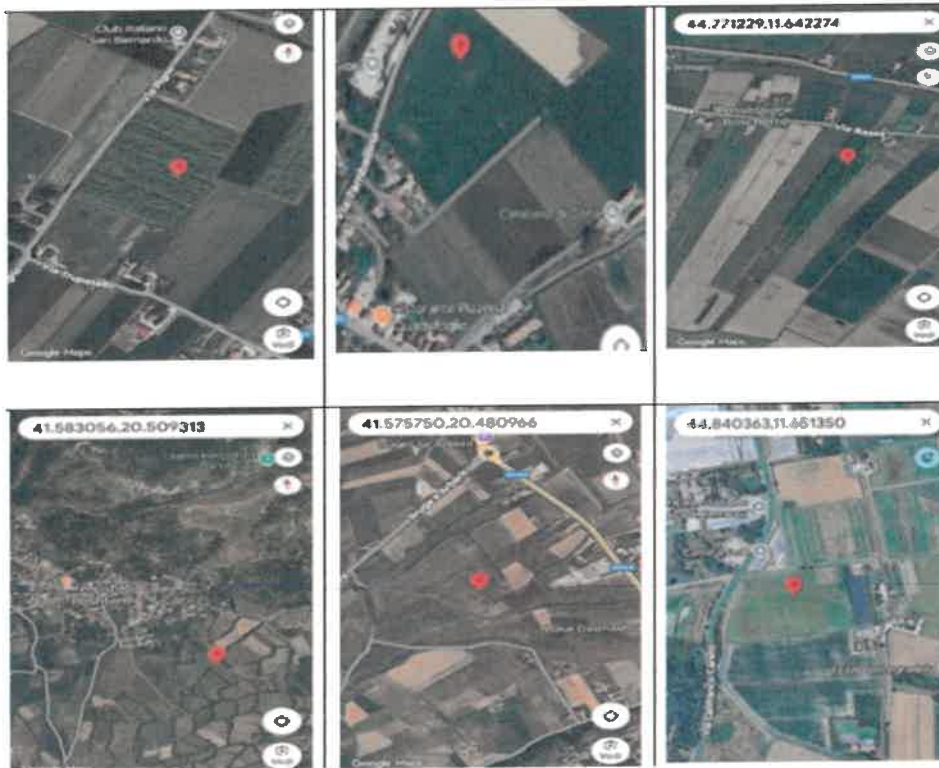
Figure 1. Satellite images with the locations where the research was conducted

The research was carried out in bamboo plantations of different ages, established in various locations in Italy and Albania, with control points (repetitions) of 1 m 2 set along the diagonal of each plantation. At these points, biometric determinations were made regarding the number of differentiated stems per bamboo plant after 12 months of growth, as well as the height and diameter of the stems.